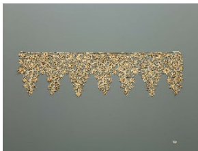
Border made of Reticella Needle Lace and Bobbin Lace, Collection of the Textile Museum St.Gallen, Inv. No. 00091, Photo: Michael Rast