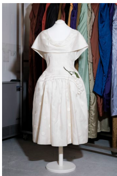
White Dress with Polka Dots, Swiss Textile Collection, 2025 © Charlotte Leonie Hammann