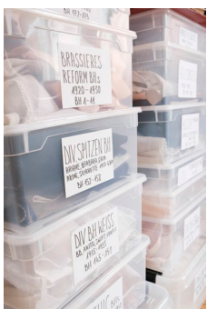
Collection 'Femininity in Form' by Beata Sievi, 2025