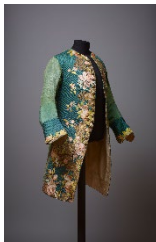
Men's Tailcoat, ca. 1780, France, Collection of the Textile Museum St.Gallen Inv. No. 21497, Photo: Michael Rast