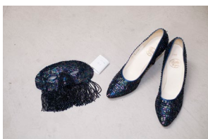
Sequin-covered Mask and Shoes, Swiss Textile Collection, 2025 © Charlotte Leonie Hammann