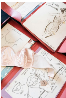
Historical Lingerie and Archival Material, Collection 'Femininity in Form' of Beata Sievi, 2025