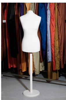
Mannequin at the Depot of the Swiss Textile Collection, 2025