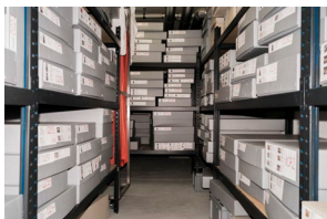
Depot of the Swiss Textile Collec- tion, 2025