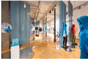
Ausstellungsansicht "Circle of Water. Textilien im Fluss" / Exhibition View "Circle of Water. Textiles in Flux"