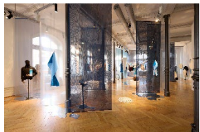
Ausstellungsansicht “Circle of Water. Tex- tilien im Fluss“ / Exhibition View “Circle of Water. Textiles in Flux”