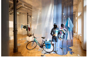
Ausstellungsansicht "Circle of Water. Textilien im Fluss" / Exhibition View "Circle of Water. Textiles in Flux"