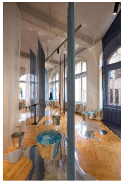
Ausstellungsansicht "Circle of Water. Textilien im Fluss" / Exhibition View "Circle of Water. Textiles in Flux"