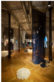
Ausstellungsansicht "Circle of Water. Textilien im Fluss" / Exhibition View "Circle of Water. Textiles in Flux"