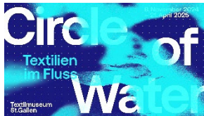
“Circle of Water. Textilien im Fluss” / “Circle of Water. Textiles in Flux” Key Visual